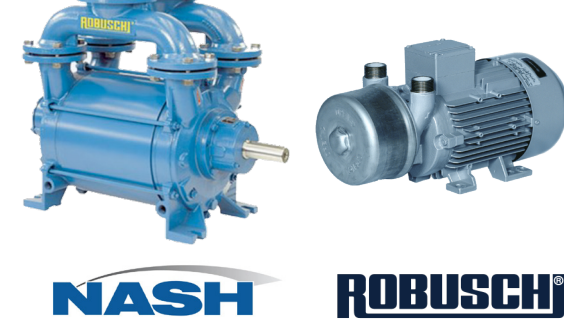
by Gardner Denver